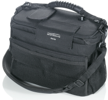
Evergo Portable Oxygen Concentrator