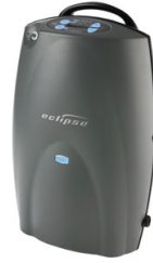
Eclipse POC