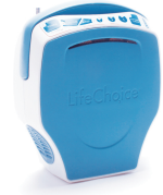
LifeChoice® Portable Oxygen Concentrator