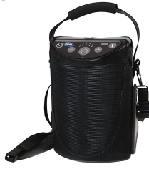
Invacare XPO2™ POC